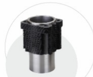
Air Cooled Block