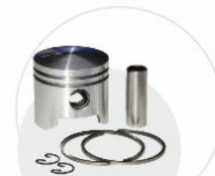
Piston Ring Pin